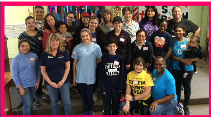
Community Bible Church