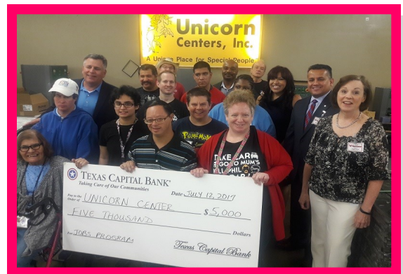
Texas Capital Bank

Groups - big and small - are making HUGE impacts! Whether your group wants to get their hands dirty making our campus more beautiful or dance the day away with our clients, we have a project perfect for your organization! Volunteer today!